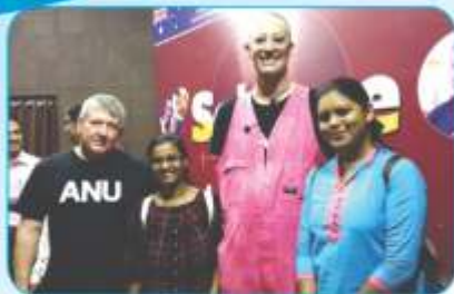
Teachers and students attending Science Circus