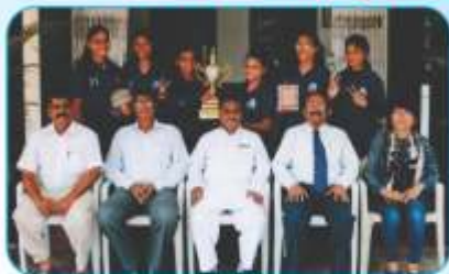
Volley Ball – Women Dhanwate Sports Festival 18th Sept. to 20th Sept. 2017 Winner