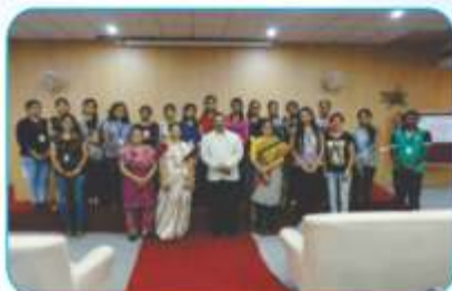
Teachers and Students at MRSC