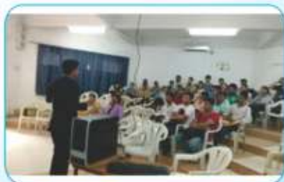
Guest Lecture On "current Trends In It Sector"