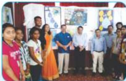
Students during the Poster Making Competition on Water Conservation.