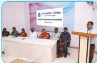
Induction Programme: Humanities: 24-07-2017