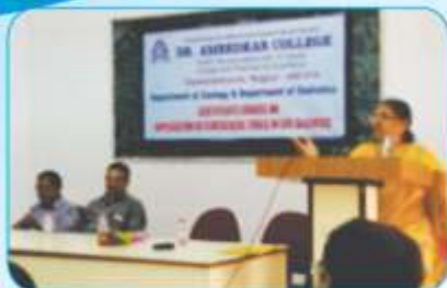
Bridge Certificate Course