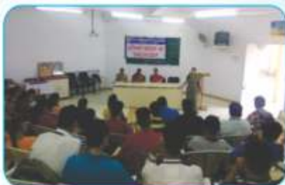
Workshop on "unemployment causes and consequences"