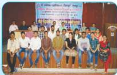
Three days' Workshop organized on 'Writing Skill' organized by UNICEF Charkha foundation Maharashtra Branch Mumbai at Mumbai.