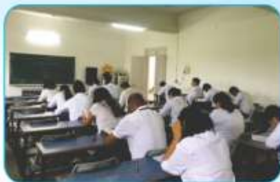
First round of the Conquest Exemplar