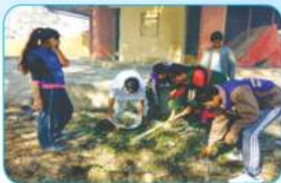
Swachatta Mohim, in slum area