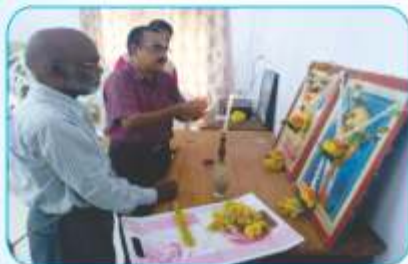
Staff members garlanding and lightening