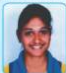
Bhagyashri Dharmik West Zone - Jaipur 10-13 Oct 2017. (Volleyball)