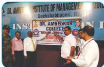
Inauguration Of NSS Unit :