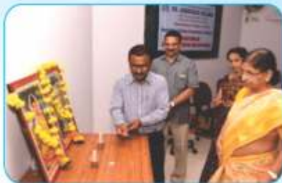
Inauguration of Certificate Course