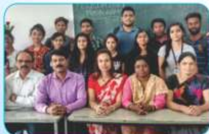
Felicitation Of Placed Students