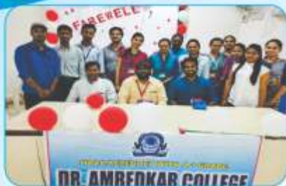
Farewell Program for M.sc-sem IV students on 19-05-2017