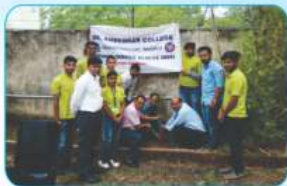
Tree Plantation Program