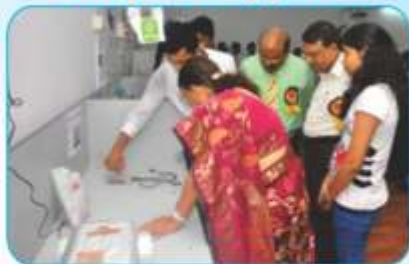
Science Exhibition On E-waste