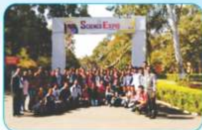
Students in the Expo