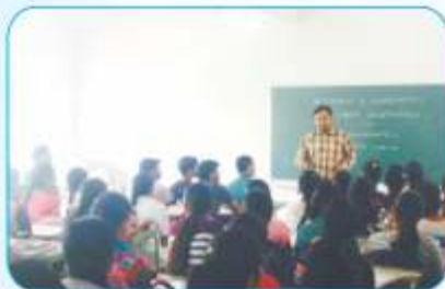
Career Opportunities in Mathematics