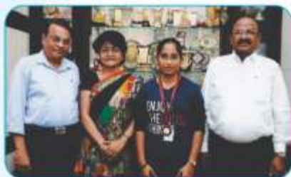
27th November - Event Air Pristal Inter Colleg Parts Bronze All India Selection Amritsar-9 to 15 Dec.2017 Punjab University