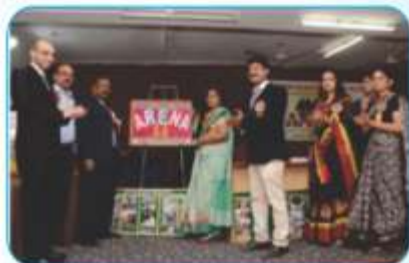
Installation Of Society Of Computer Application And Inauguration Of Annual Function (arena)