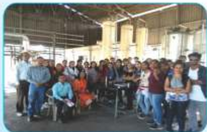
Faculty members with students