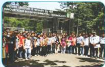
Visit to National Environmental Engineering Research Institute M S c Chemistry students participation in workshop