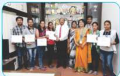
2nd prize in Role play competition in National Conference organized by C P & Berrar College, Mahal