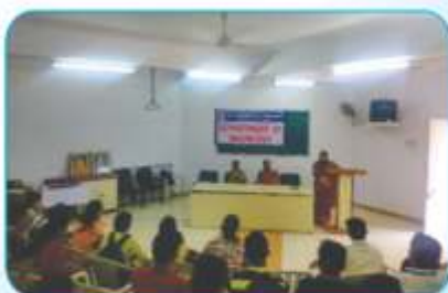
Guest Lecture Preparation of UPSC & MPSC Exam