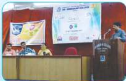
Guest addressing the students during the event Genesis