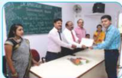
Workshop On "proficiency In Computer Application"