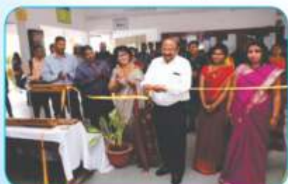
Exhibition of Psychological Tests and Certificate Distribution