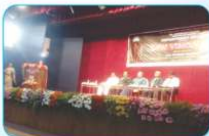
Adv. Prashant Bhushan along with other dignitaries & three judges judging case study competition