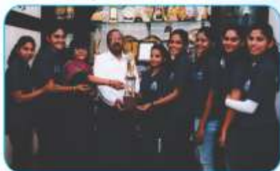
Volleyball Intercollegiate Tournament Orginal R.T.M. Nagpur University Championship (WOMEN) Dt. 12-3-2018