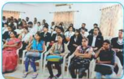
Audience attending the programme